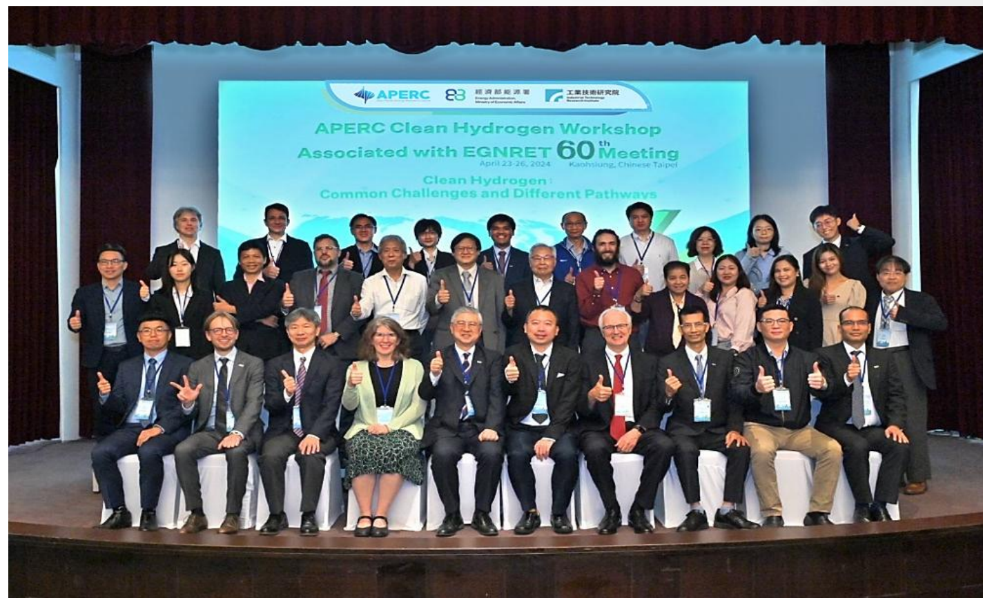
APERC Clean Hydrogen Workshop associated with the EGNRET 60 Meeting